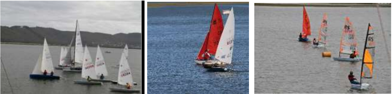
Above: Commodore Cup 2 sailing photo's