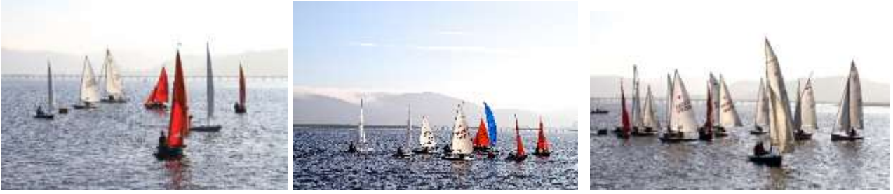
Lovely to see those red Mirror sails on the water – photos from Commodore's Cup 1