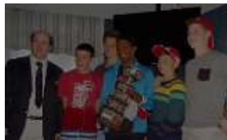
Very proud Junior Commodore Cup Trophy Winners